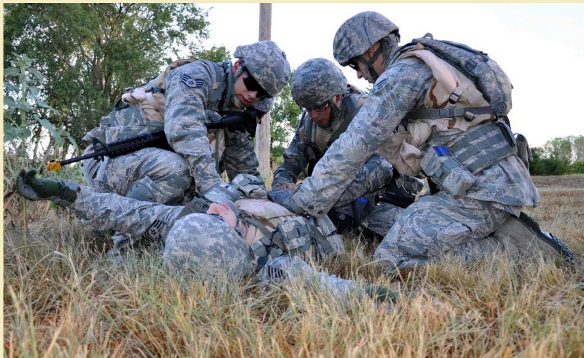
Security Forces Members respond to a training scenario involving a wounded Airman as part of a field training exercise conducted at McConnell Air Force Base, Kan. The 507th Security Forces Squadron conducted similar training in preparation for their deployment this month.